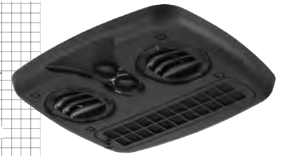
Low profile ceiling plenum blends with any interior.