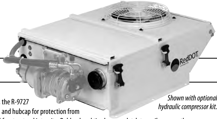
Shown with optional hydraulic compressor kit.

The R-9727 sets the standard for rooftop air conditioners in tough work environments. Renowned for its build quality, reliability, and performance, the R-9727 uses a sealed, long-life evaporator and condenser motor with a slinger ring and hubcap for protection from weather and dust. The heavy-gauge steel casing is gusseted and reinforced for structural integrity. Rubber hood tie-downs unlatch to easily expose the components for service. Options include a hydraulic compressor kit, remote-mount filter, and in-line booster blower for a pressurized, dust-free cab.